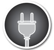
Plug in 120V (convertible 240V*)