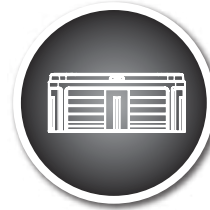
Put in place**