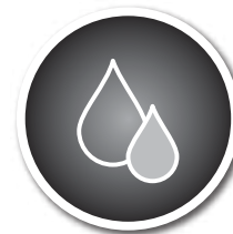
Fill with water