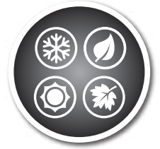
4 seasons insulation