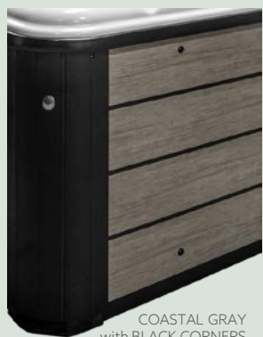
COASTAL GRAY with BLACK CORNERS